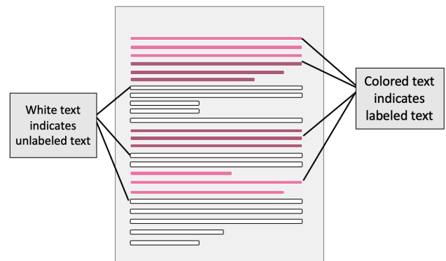
Figure 1. Architects can skim processed documents to verify classified requirements (colored text) and find “white space” to manually classify (design mockup to maintain confidentiality).

After extraction, the extracted and classified content must be verified – this is a two-step process that involves assessing both the precision and recall of the system’s NLP. One part of this verification process involves inspecting the documents using an HTML viewer, skimming for “white space” (text that was not classified) and manually labelling such content as appropriate. A design mockup of the HTML viewer can be seen in Fig. 1 .